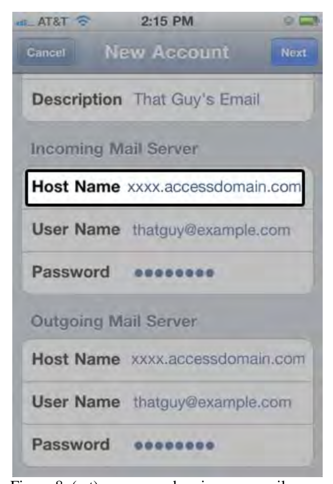
Figure 8: (mt) recommends using your mail access domain.