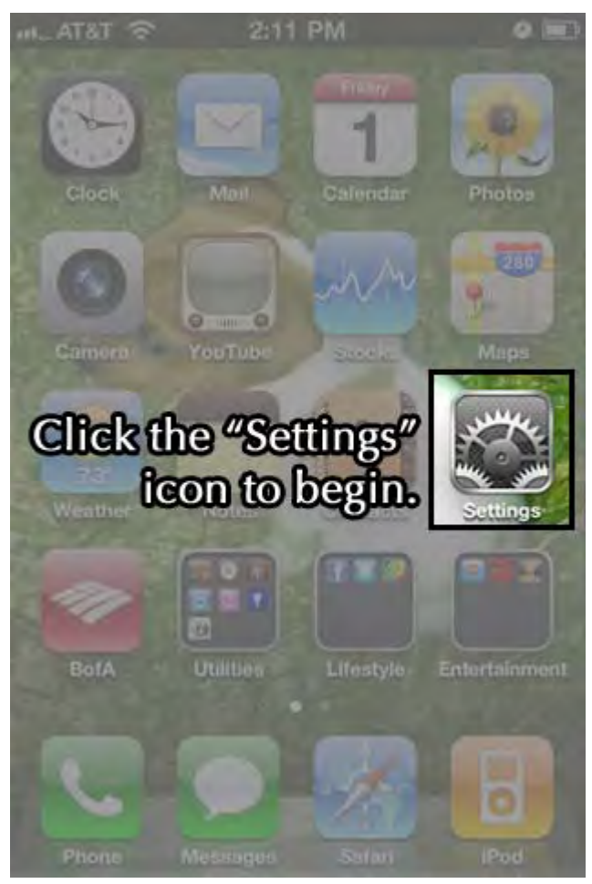
Figure 1: Click "Settings" to begin.

1. From the Home screen, choose Settings, see Figure 1: